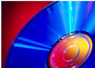
Cemetery Management Max in Single and Multiple Cemetery Releases.

Program can be customized to your cemetery at a reasonable cost. Program can be setup for you with GSS (Grave Site Setup) or modified and setup with GSL (Grave Site Layout).